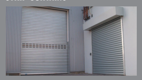
STEEL / ALUMINUM ROLLER DOORS